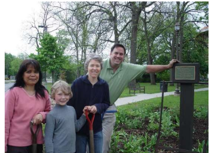
Civic Park spring 2011