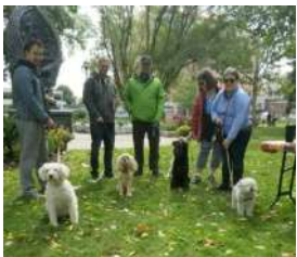
Visitors at Pop-Up Café