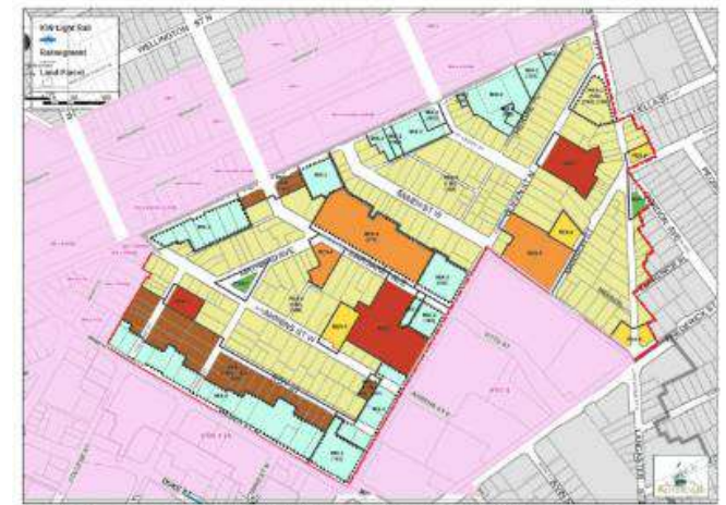
Civic Centre Secondary Plan - Proposed Zoning